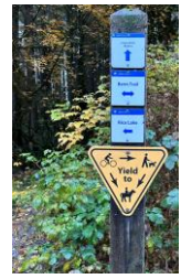
Turnoff to Richard Juryn