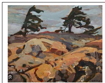
Stormy Weather Georgian Bay II painting by FH Varley